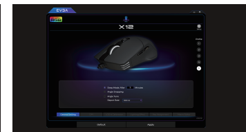
Full control and customization with EVGA Unleash RGB Software