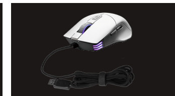
Paracord USB cable