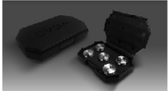
7. Weight System: Up to additional 25grams