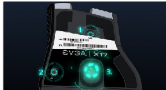
1. Triple sensor (Pixart 3389 optical sensor + 2 LOD)