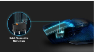
4. Quick Responding Mechanism