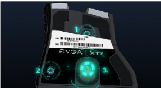
1. Triple sensor (Pixart 3389 optical sensor + 2 LOD)