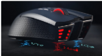
2. 3-Dimension Array Tech