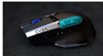
6. Ergonomic Design with Sniper Button