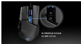
5. On the fly DPI + 5 Onboard profiles