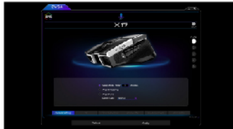
8. EVGA Unleash RGB Software: Full control and customization with EVGA Unleash RGB Software