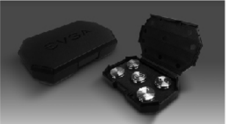
7. Weight System: Up to additional 25grams